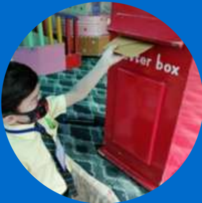
World Post Day