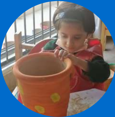
World Soil Day