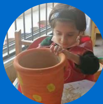
World Soil Day