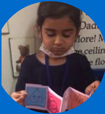
Global HAndwashing Day