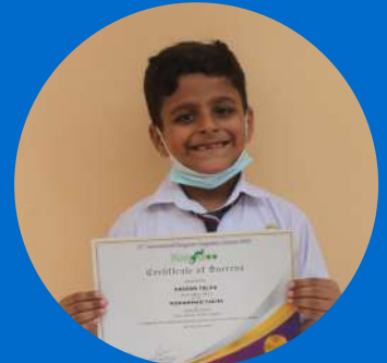
International Kangaroo Mathematics Competition

Besides developing academic excellence, the school strongly believes in the importance of co-curricular activities for students' holistic growth.