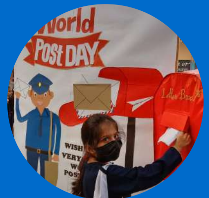
World Post Day