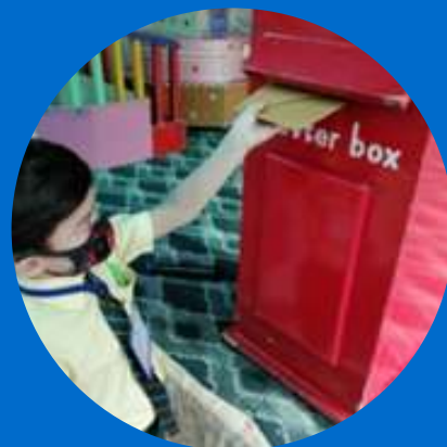
World Post Day