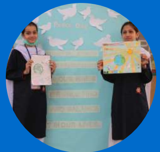
World Peace Day