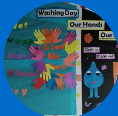
Global Handwashing Day