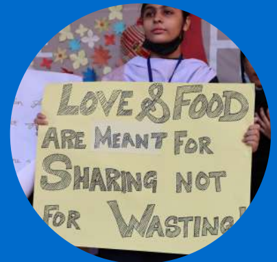
World Food Day