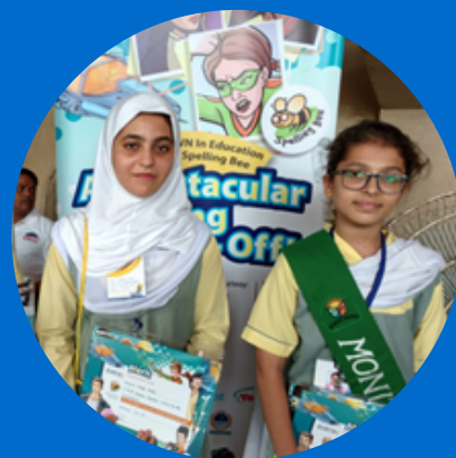
Dawn Spelling Bee