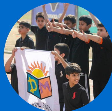
Inter School Throw ball Competition