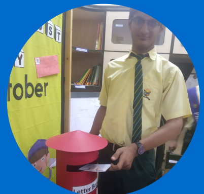
World Post Day