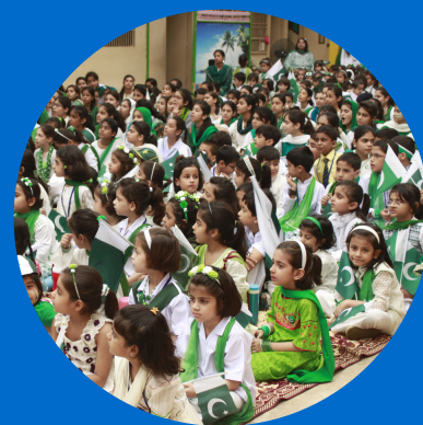
Independence and Resolution Day