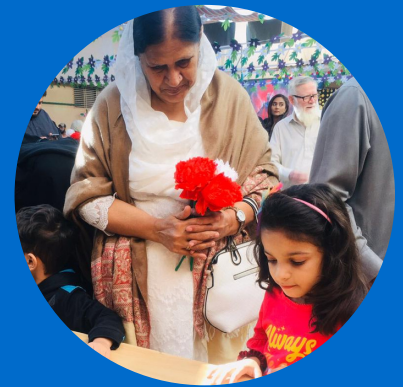
Grand Parents Day