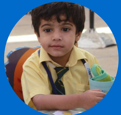
World Water Day