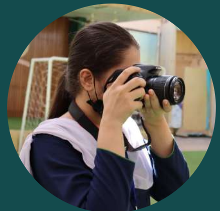
F.Y.I. Club (Social Media Club)