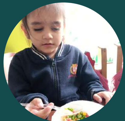
Fruits and Vegetables Day