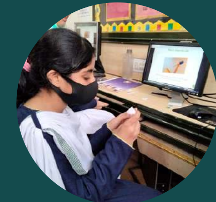
Charles Algorithm (Programming Club)