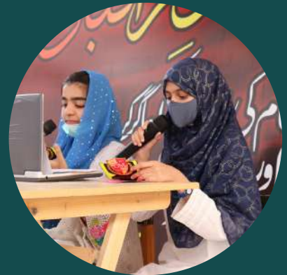
افکار مقصود (Urdu Dramatics)