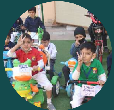
No Pedal Race