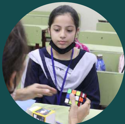
Archimeets Logic (Maths)