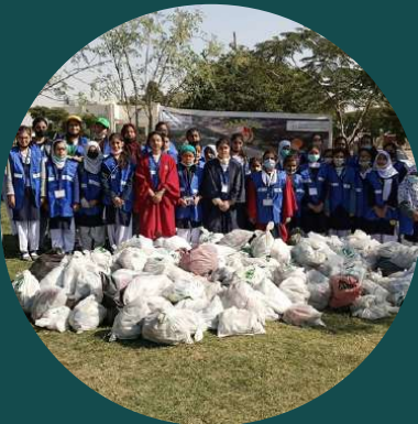
Edhi Hands (Community Service)