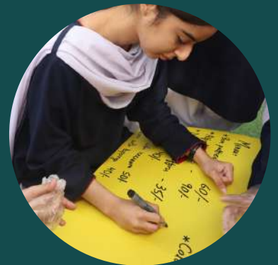
Agha's Gallery (Art Club)