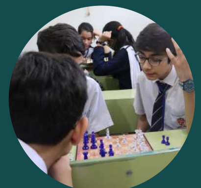
Knights Of the Square Table (Board Games Club)