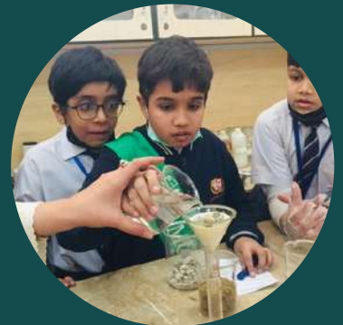
A.Q. Lab (Science Club)