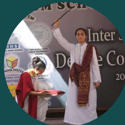
Ibsen Theatre (English Dramatics)