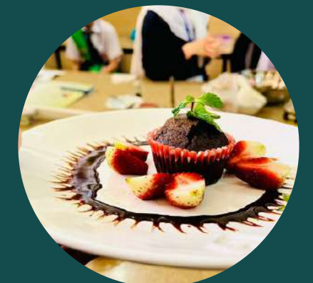
Escoffier's Craft (Culinary Club)

We are extremely proud of our students for their hard work and diligent efforts. Keep making us proud!