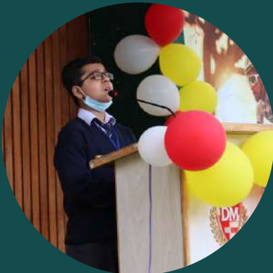
William's Pen (English Literary club)