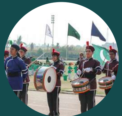
Octa Strings (Melody Club)