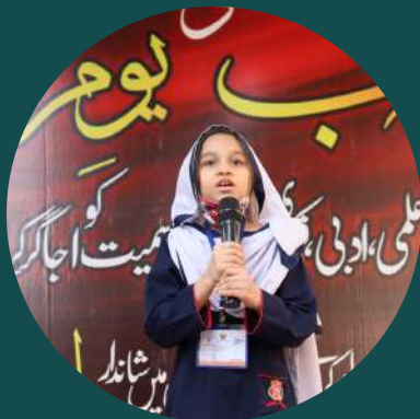
نظریہ انور (Urdu Literary Club)