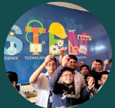
HydraBot (Robotics Club)