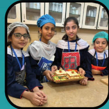
International Chefs Day