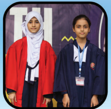
Head & Deputy Head Girls KAECHS - Primary Section