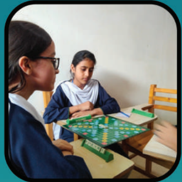
Inter House Scrabble Competition