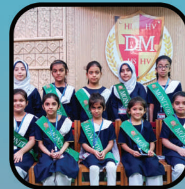
Monitors-Girls Bahadurabad Primary Section