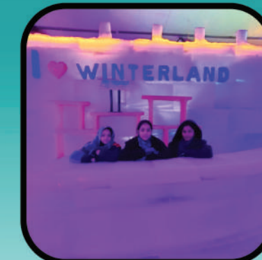
Trip to Winter Land

9TH ANNUAL GRAND SPORTS DAY COMING SOON!