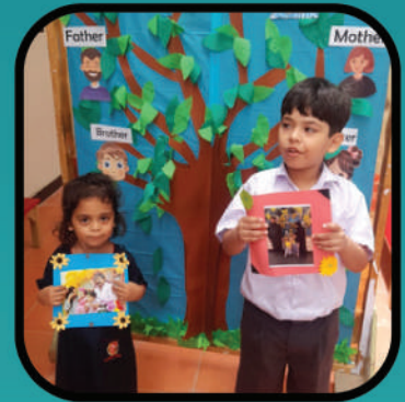
Family Tree Activity