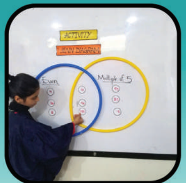
Venn Diagram Activity