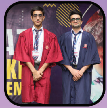
Head & Deputy Head Boys KAECHS - Secondary Section