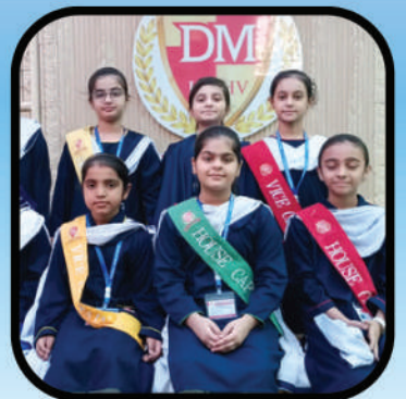
Houce & Vice House Captains Girls Bahadurabad Primary Section