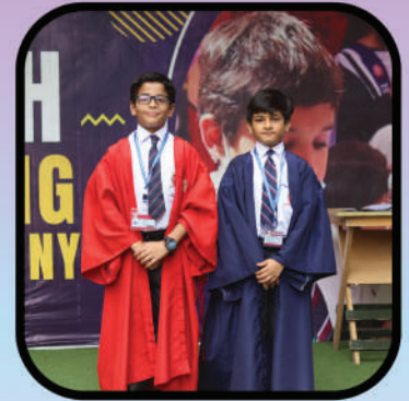
Head & Deputy Head Boys KAECHS - Primary Section