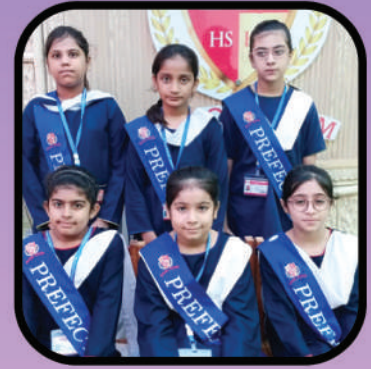
Prefectorial Council Girls Bahadurabad Primary Section