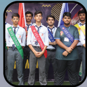
House & Vice House Captains Boys KAECHS Secondary Section