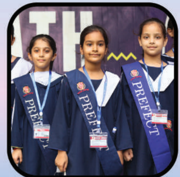
Prefectorial Council Girls KAECHS Primary Section