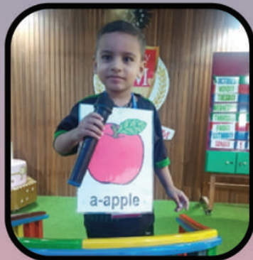
Special Morning Assemblies