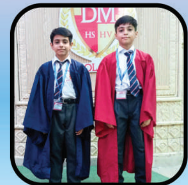
Head & Deputy Head Boys Bahadurabad Primary Section