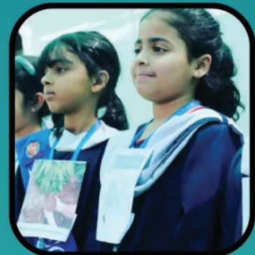
World Water Day