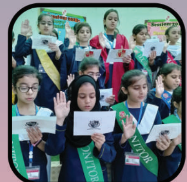
Oath Taking Ceremony

9TH ANNUAL GRAND SPORTS DAY COMING SOON!