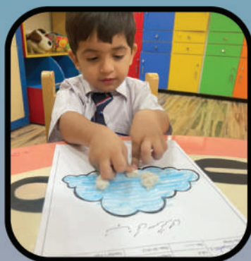
Cotton Pasting Activity