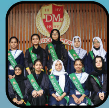
Monitors-Girls KAECHS- Secondary Section