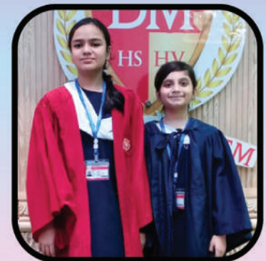
Head & Deputy Head Girls Bahadurabad Primary Section

We're thrilled to announce our dynamic young leader of the student council for the academic year 2023-2024! These bright minds will steer our school to new heights, encouraging unity, innovation, and a positive change. Get Set and go for an exciting year of growth and student empowerment!