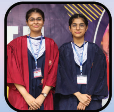
Head & Deputy Head Girls KAECHS - Secondary Section