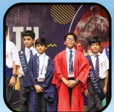
Prefectorial Council Boys KAECHS Primary Section