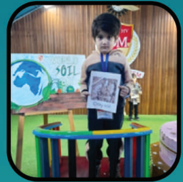
World Soil Day