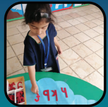
Sky Letter Activity