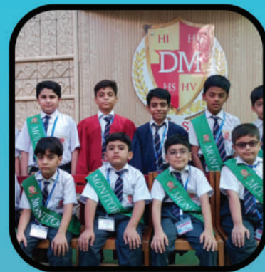
Monitors-Boys Bahadurabad Primary Section