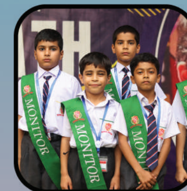
Monitors- Boys KAECHS Primary Section