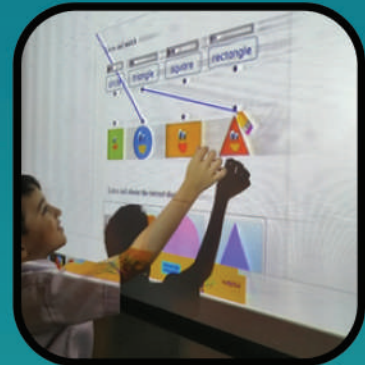
Digital Literacy & ICT