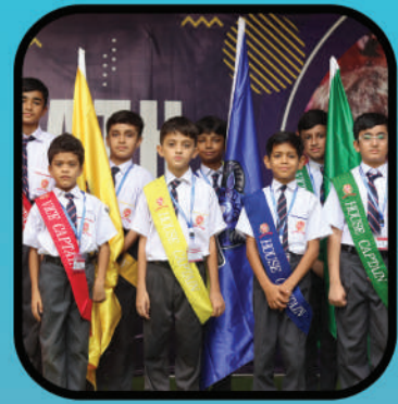
House & Vice House Captains Boys KAECHS Primary Section