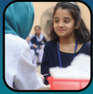
World Oral Health Day