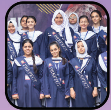
Prefectorial Council Girls KAECHS Secondary Section