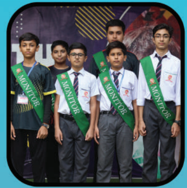
Monitors-Boys KAECHS- Secondary Section