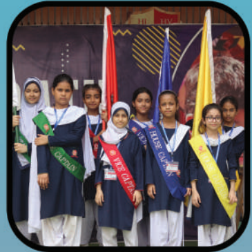
House & Vice House Captains Girls KAECHS Primary Section