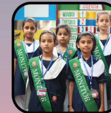
Monitors-Girls KAECHS Primary Section