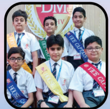
Houce & Vice House Captains Boys Bahadurabad Primary Section