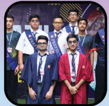
Prefectorial Council Boys KAECHS Secondary Section