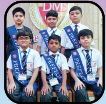
Prefectorial Council Boys Bahadurabad Primary Section