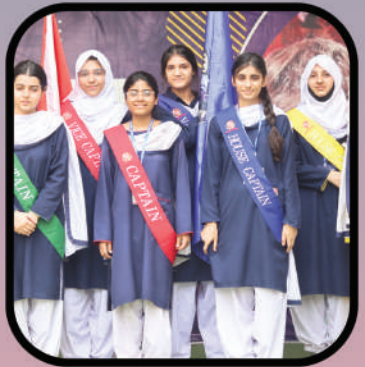
House & Vice House Captains Girls KAECHS Secondary Section